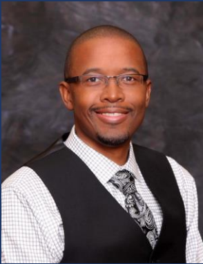
President Quincy Branch BBC